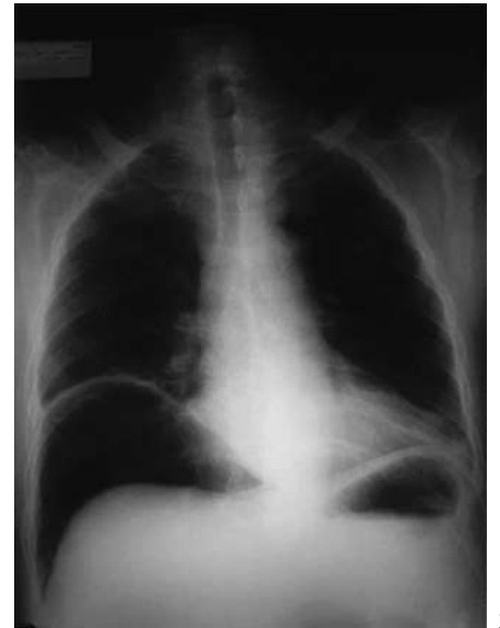
Fig. 1. Abdominal CT scan of the patient 4 weeks after surgery. Fig. 2. Repeat chest X-ray of the patient 8 weeks after surgery.